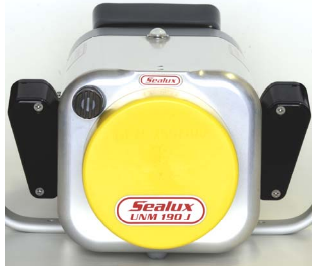
The front cover is included in the price.

Further accessories see: SEALUX accessory and light systems.